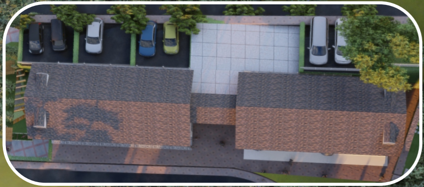
CLUB HOUSE & COMMERCIAL SPACE